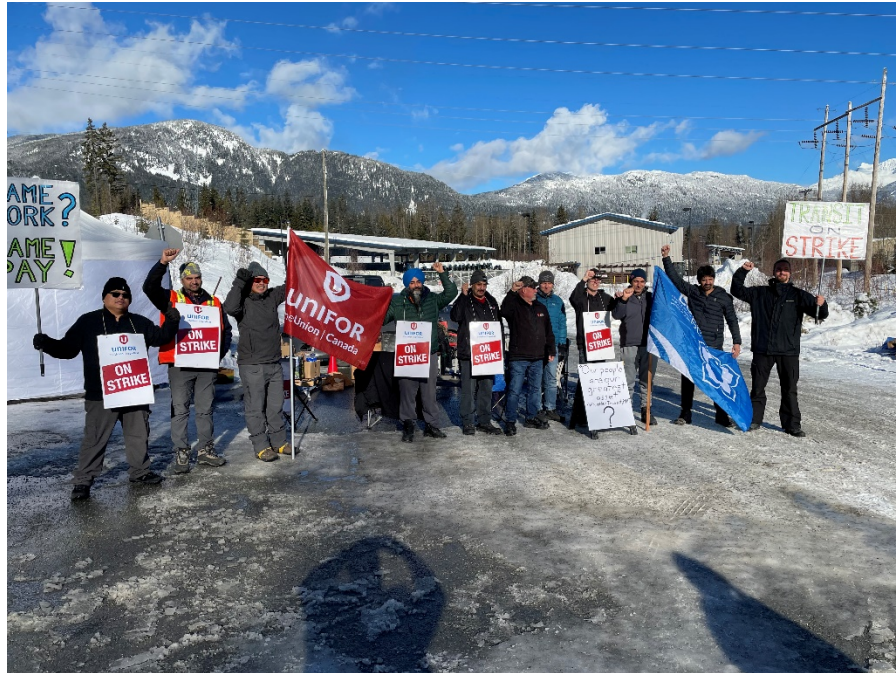
Whistler Transit Members Local 114 on Strike

Whistler Transit and Squamish Transit (Diversified)