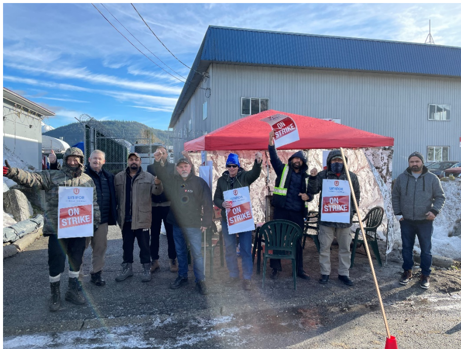
Squamish Transit Members Local 114 on Strike

More Photos at https://www.facebook.com/media/set/?set=a.275133844704342&type=3