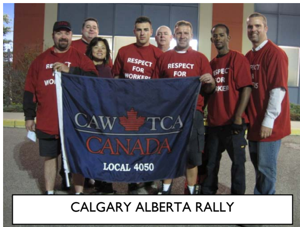
CALGARY ALBERTA RALLY

On Thursday October 7, 2010 over 80 DHL employees, members of CAW Local 4050 in Alberta, staged an early morning protest to demand that DHL management respect their right to be heard, respected and included in the success of the company and to demand that DHL stop ignoring their collectively elected voice, namely the Canadian Auto Workers Union.