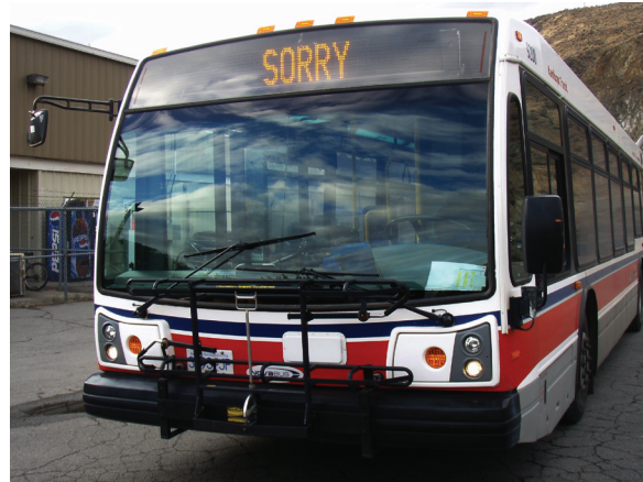
BUSES PASSING YOU BY...

The Canadian Auto Workers Local 114 represents the more than 90 operators who serve every major community, including Barnhartvale, Dallas, Aberdeen, Sahali, Heffley, Rayleigh, North Shore, Brocklehurst, Batchelor Heights, and Westsyde.