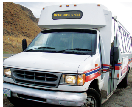
NEED MORE HANDY-DARTS...

That's why we've started the More Buses/ Operating Hours Now! campaign, to push the provincial government, First Bus and City Hall to take action to improve our vital bus system for everyone.